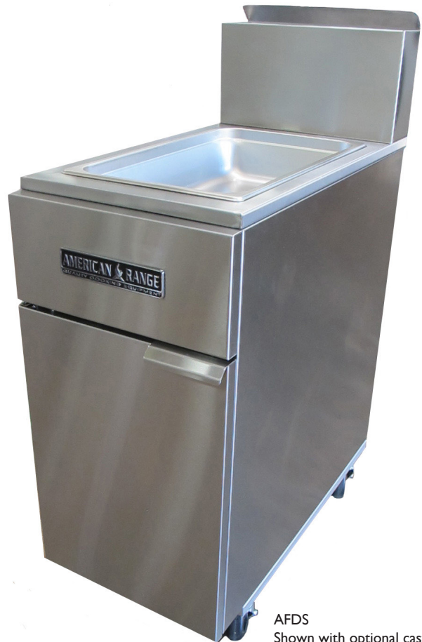
AFDS Shown with optional casters