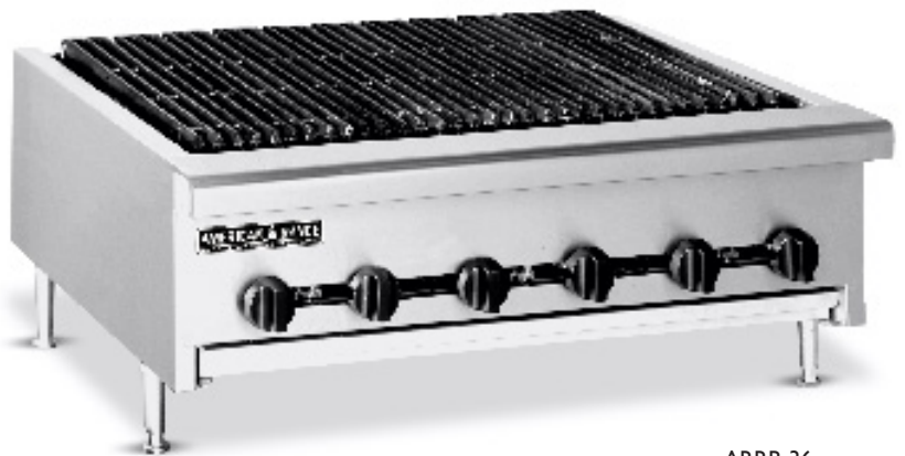
ARRB-36 Shown with optional 4" counter legs